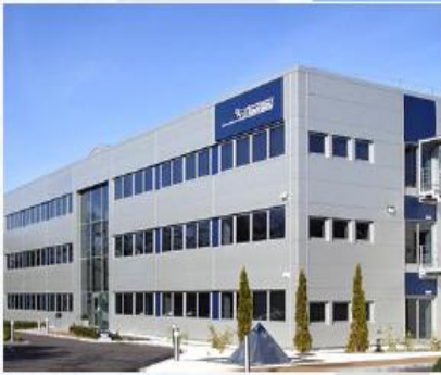
Saudi Arabia office (4410m 2 )