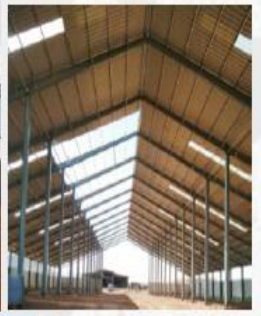
Algeria 5000sqm warehouse-size:L50m*W100m*H5m(5000sqm)