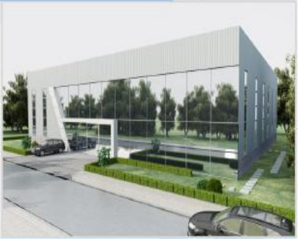
Philippine exhibition hall (3200m 2 )